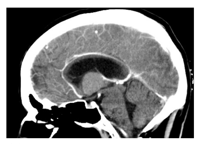
Fig 2: CECT of brain, sagittal section of third ventricle showing a huge colloid cyst