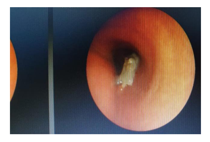
Figure 3: Bronchoscopic view of the chicken bone in the left main bronchus.