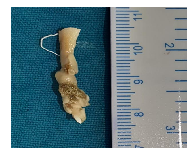
Figure 4: Extracted chicken bone measuring 30mm.