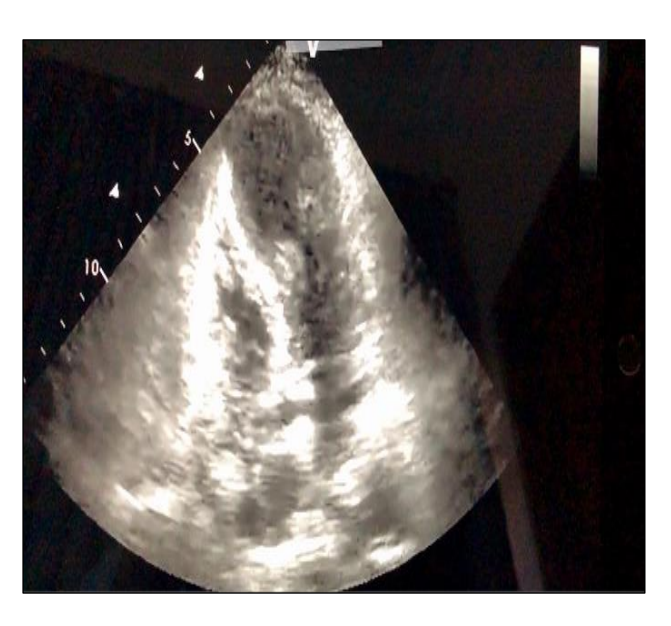
Figure 2: Echocardiography showing apical ballooning.